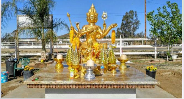
33170 Leon Rd, Winchester, CA 92596 Facebook